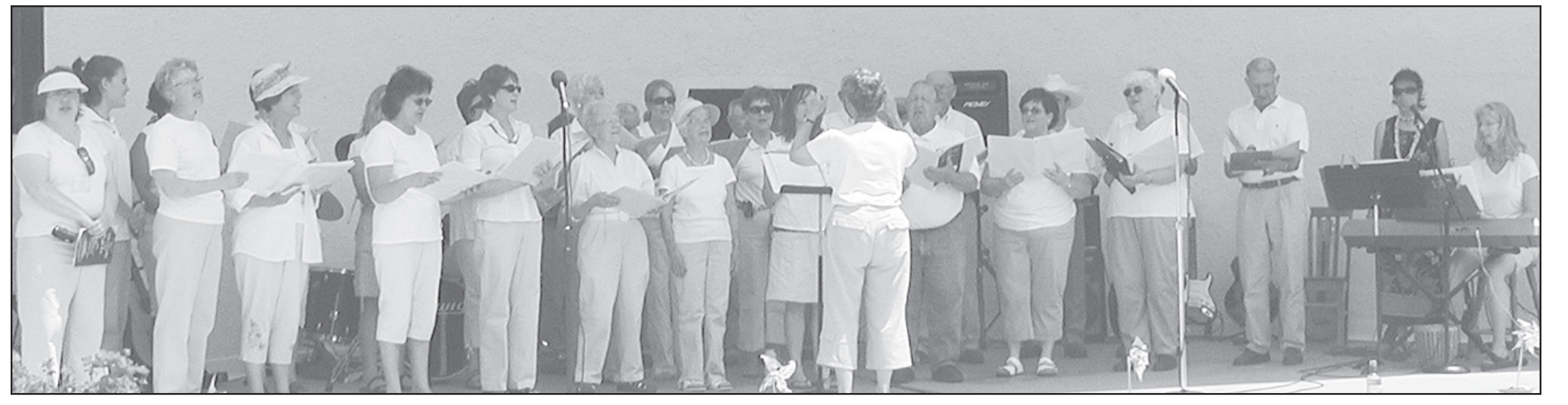
St. Francis Singers performed during the Diamond Jubilee Celebration.