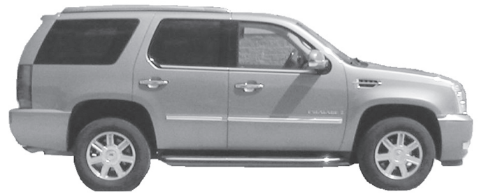
2007 Cadillac Escalade, Bronze

Congratulation Graduates and Best of Luck in the future. At Vince's GM Center we carry a great selection of used vehicles for whatever your needs maybe.