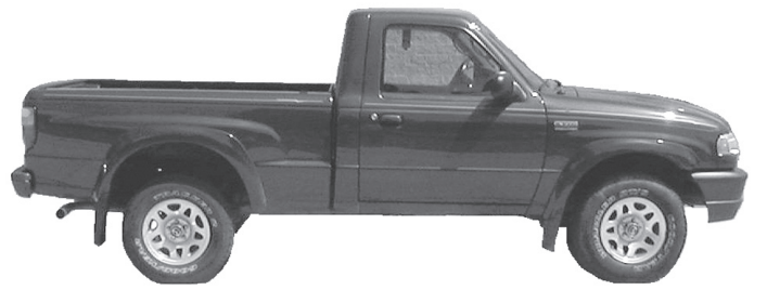
2004 Mazda B3000, Blue