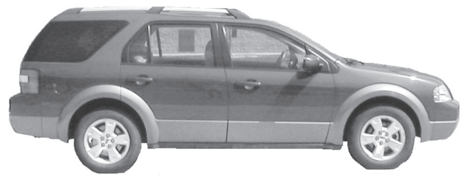
2006 Ford Freestyle, Red