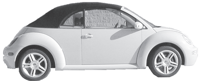
2005 VW Bug, Light Blue