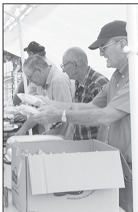
KNIGHTS OF COLUMBUS members serve the barbecue last year.