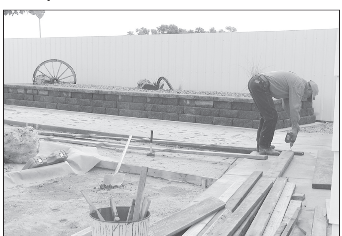
WORKMEN WERE getting the area between the two church food booths ready for customers who will be eating ice cream and funnel cakes.