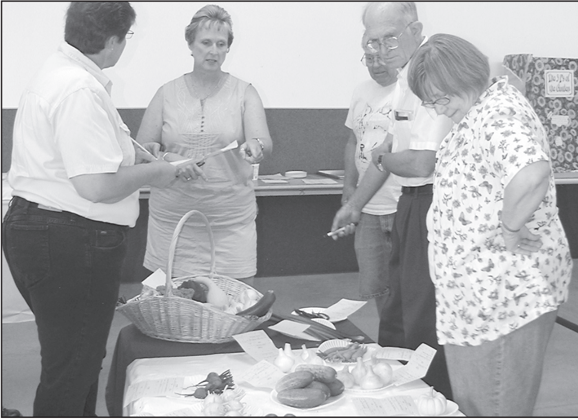
Decisions needed to be made in the judging of the vegetables.

Saturday's parade was long with a number of entries. St. Francis'