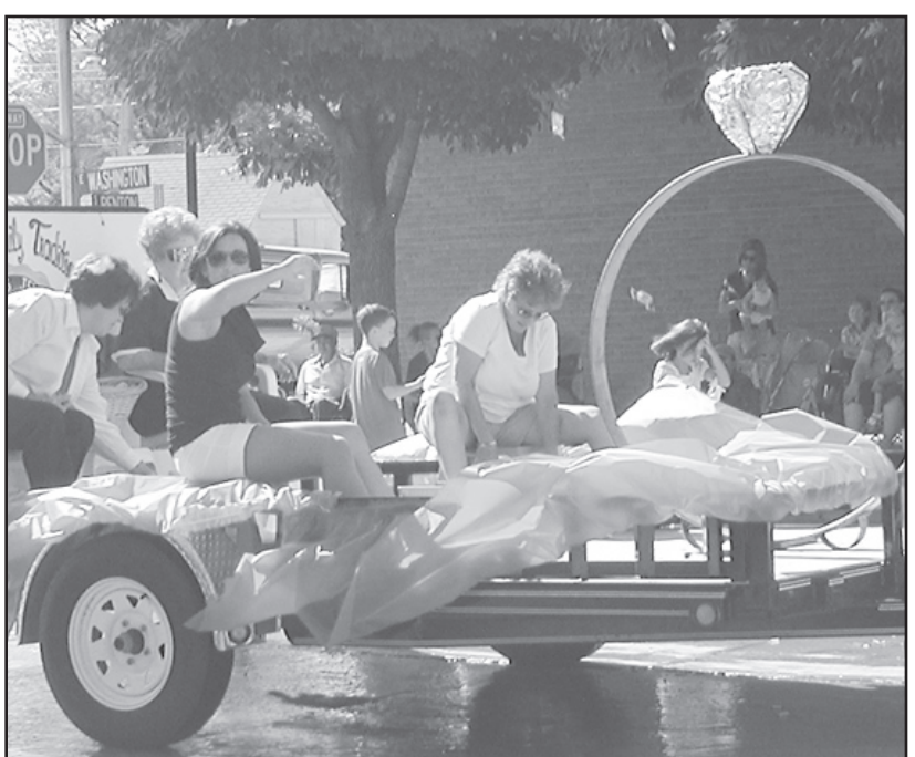
Stuart's Jewelry was the winner of the business division.