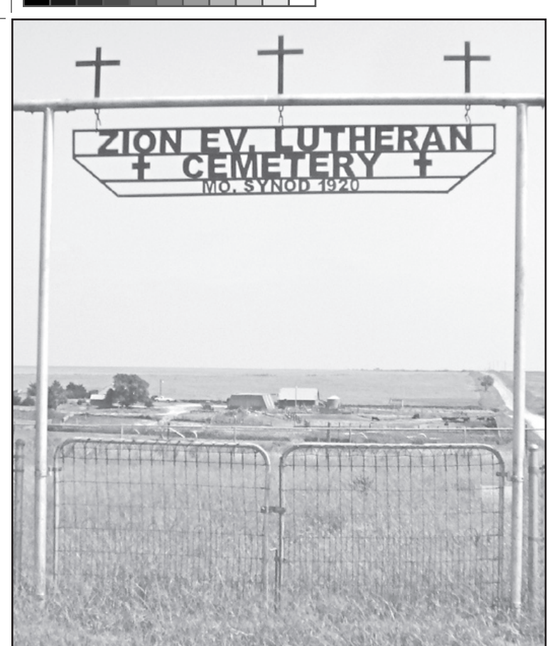
ZION EVANGELICAL Lutheran Cemetery will be one of the stops along the tour route this Sunday.