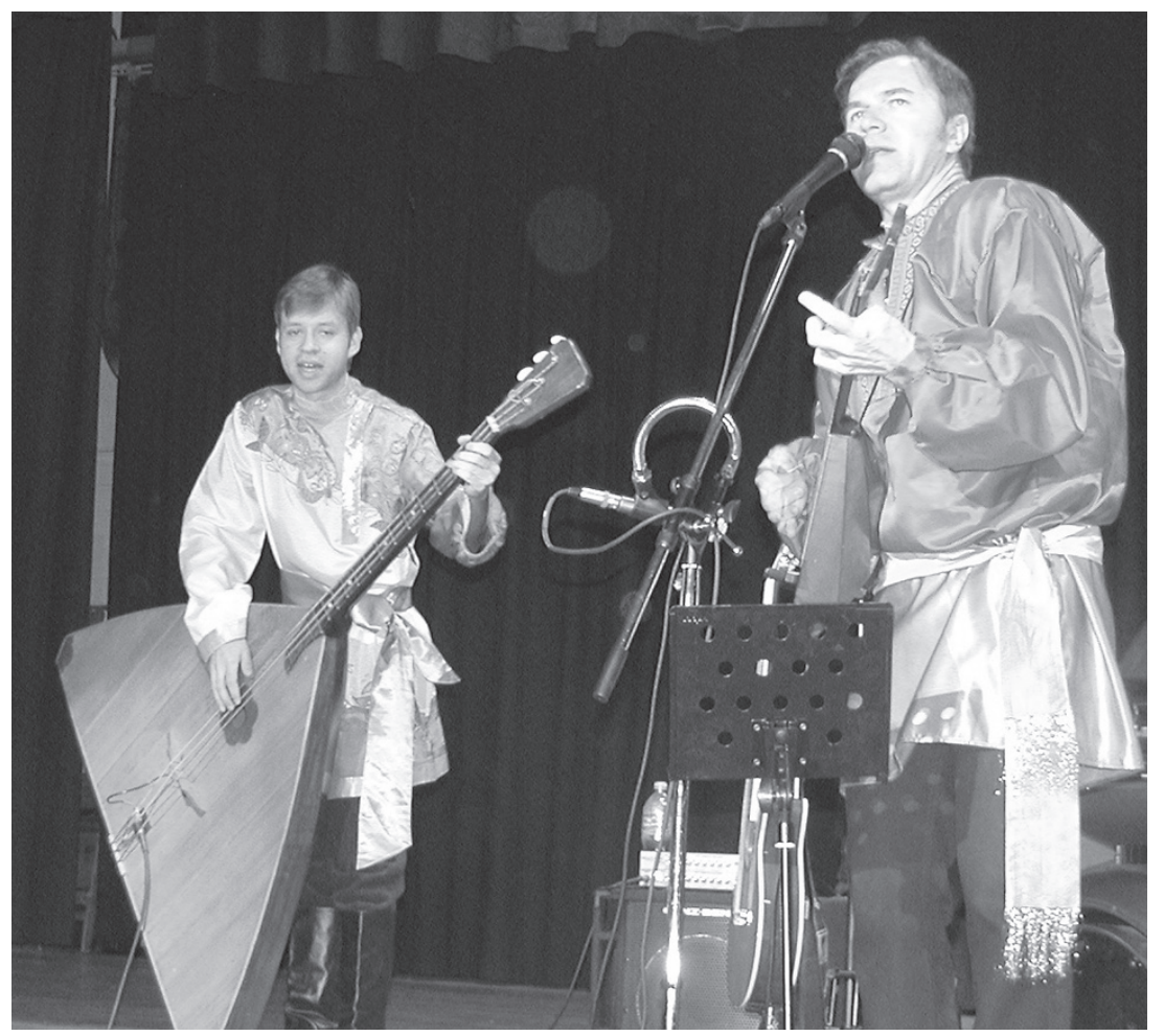
THE FLYING BALALAIKA Brothers, sponsored by Western Plains Arts Association, performed for the school on Monday.

Northwest Kansas Family Shelter provides 24-hour-7 day-a-week services to victims of domestic violence and sexual assault. Weekly support groups are available for women and children within the northwest Kansas area. For information or in need of assistance, please call the toll-free number 1-800-794-4624.