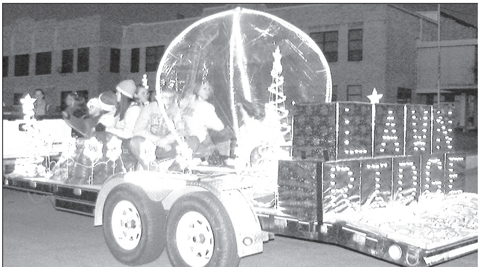
WINNER OF THE PEOPLE'S CHOICE Award was the Lawn Ridge 4-H Club.