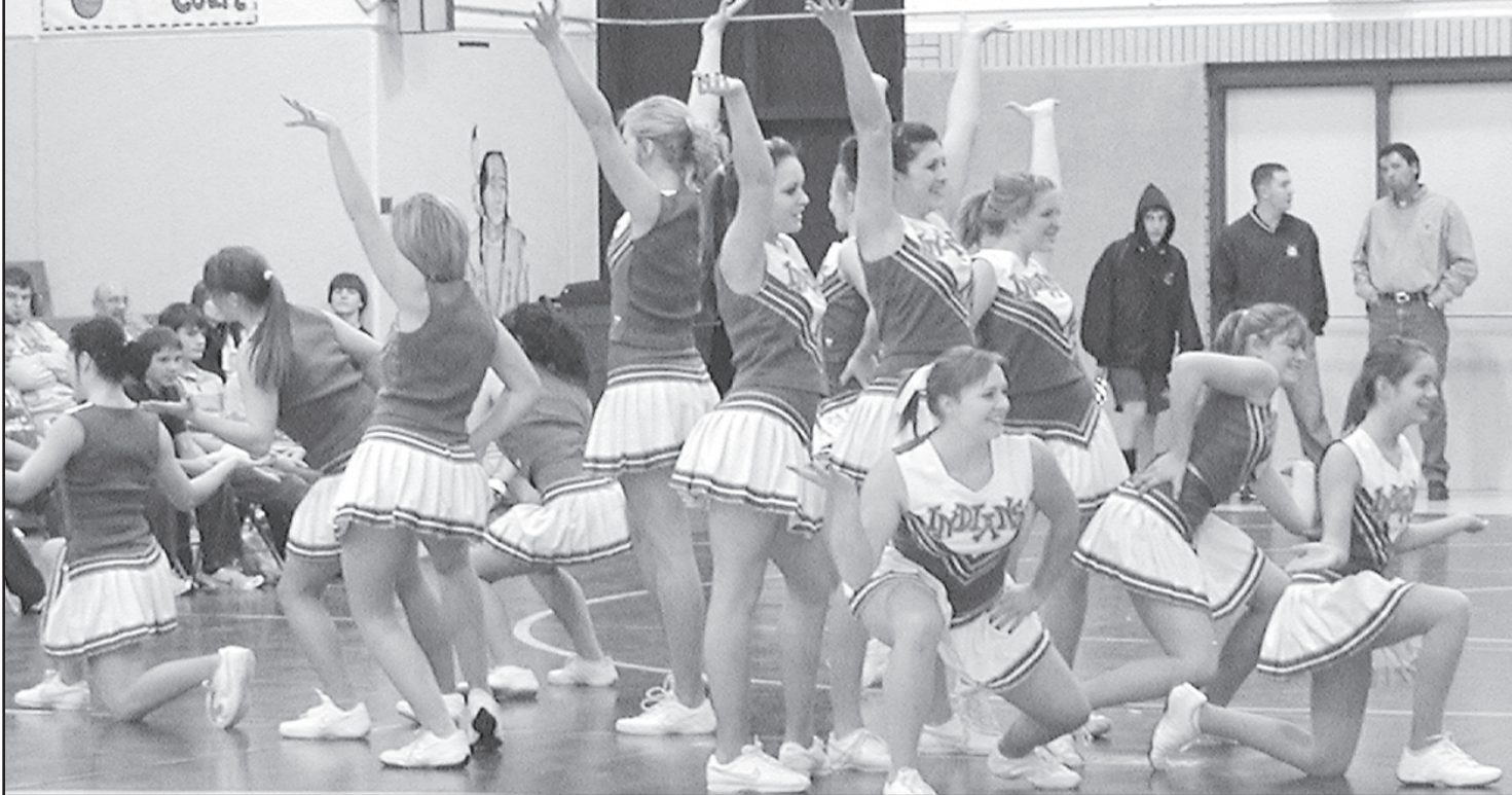
SAINTY POM PON SQUAD entertained the crowd during the Gabel-Jenkins Wrestling Tournament held Saturday in St. Francis.

All manual labor was donated and the entire cost of the church was $10,000. All debts were paid on the day of dedication.