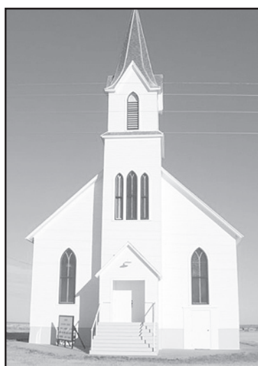
Salem Lutheran Church

Once again, the Methodist Church handbell choir will be playing several Christmas carols. Other music includes Christmas carols played and sung by Salem Lutheran Choir, Heartland Harmony Trio, Once Again Sound Band, St. Francis Singers and a number of other talented musicians. The mass choir from the