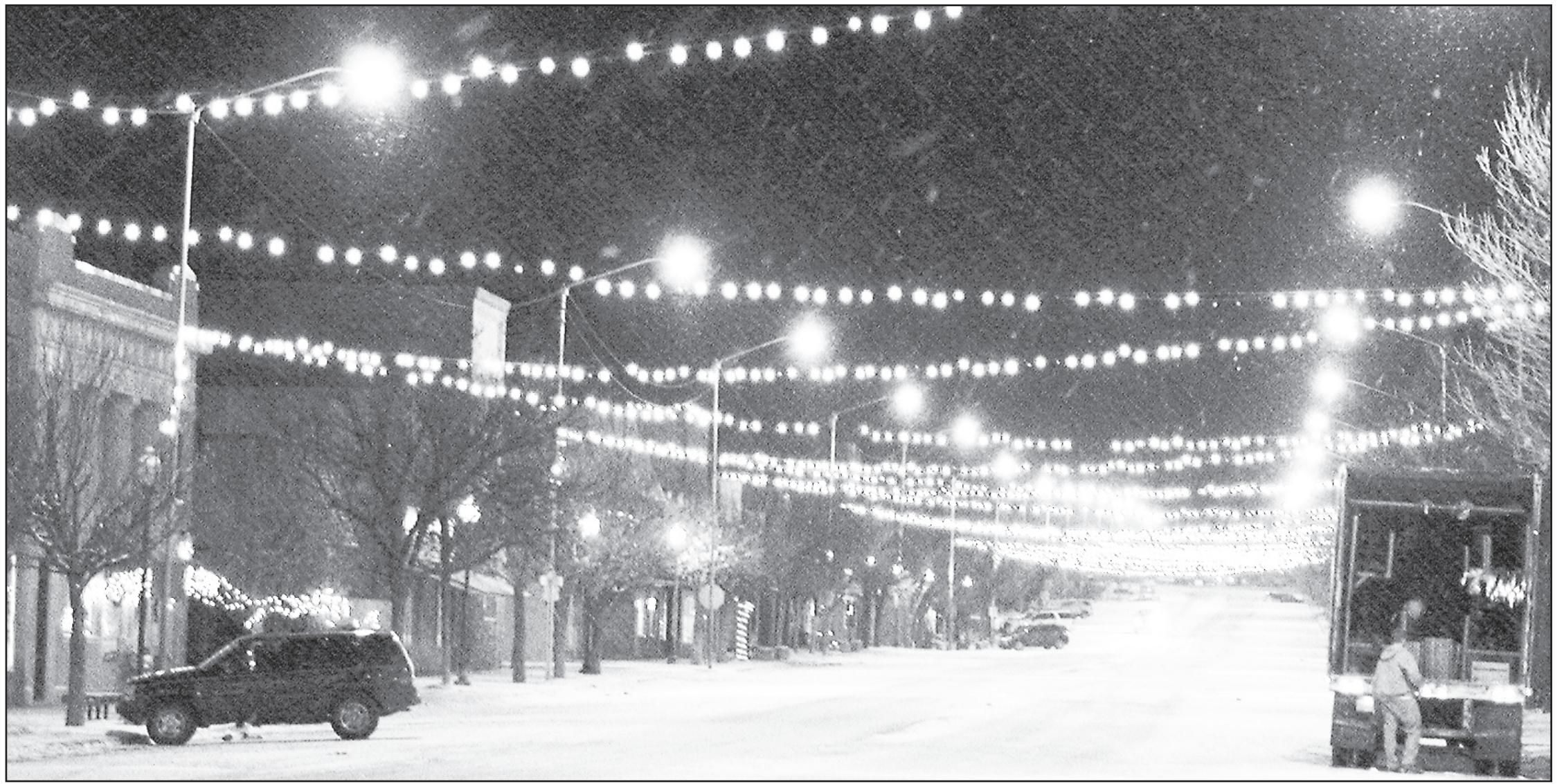
St. Francis Main Street was like a Christmas Card Monday night as the Christmas lights picked up the falling snow.