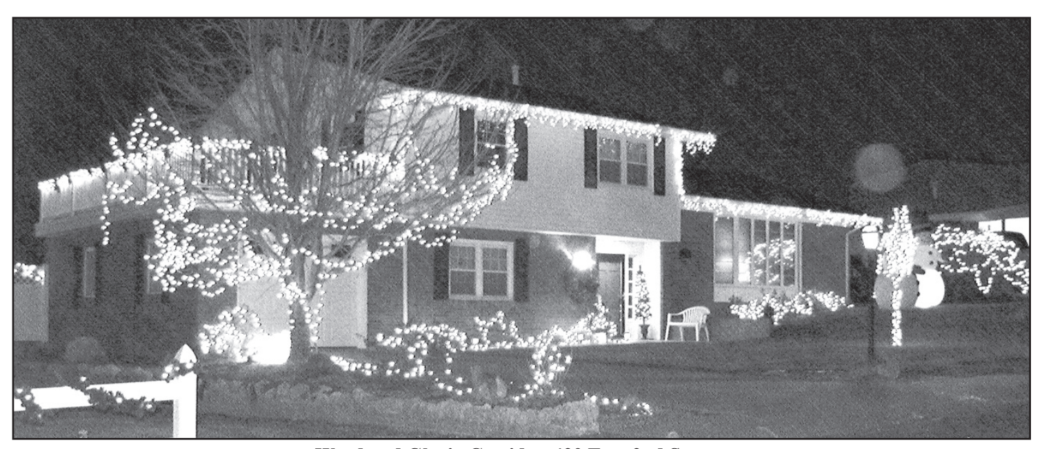
Ward and Gloria Cassidy - 420 East 2nd Street