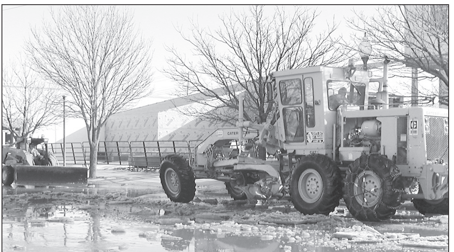
CLEARING THE ICE — After weeks of below-zero temperatures and a couple of broken water mains, St. Francis' Main Street had solid ice buildup on the south side of the street. City crews took advantage of the warm weather last week and broke up the ice so it could melt.