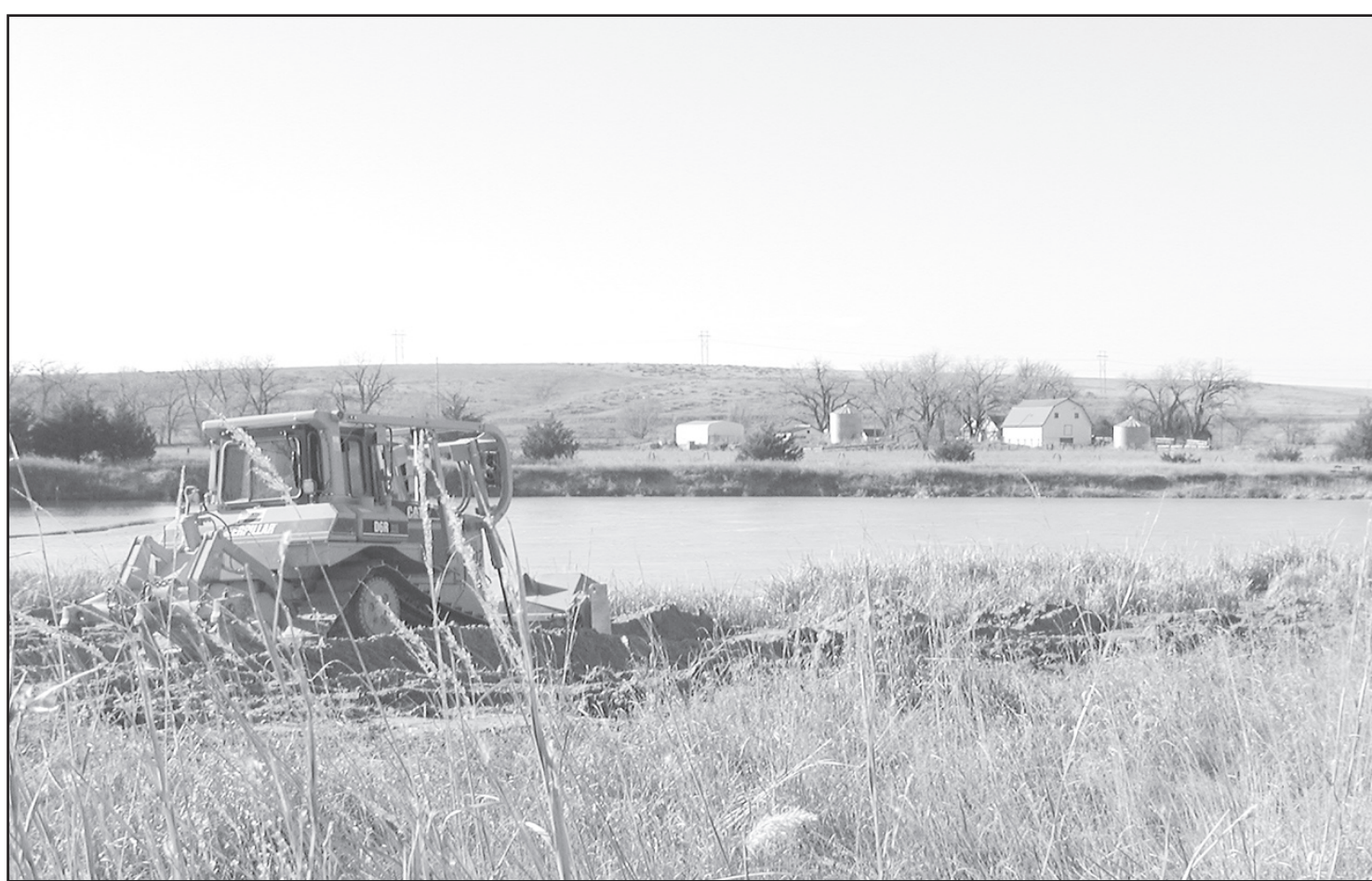
WORKINPROGRESS —Members of the county crew were busy drudging out Keller Pond as the banks had filled in. The sludge will be taken to the old landfill.