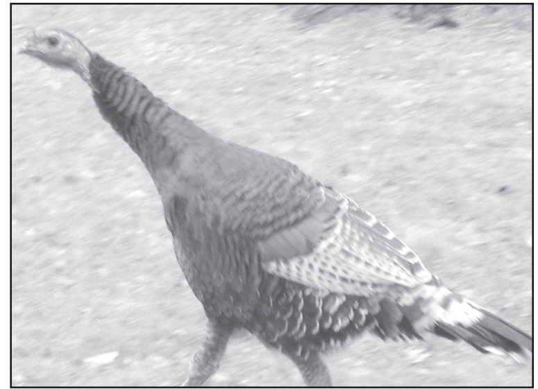
Haigler's very own Tomasena has her own habitats.

If you have been driving on the streets of Haigler; please watch out for the newest resident---a wild turkey hen! First