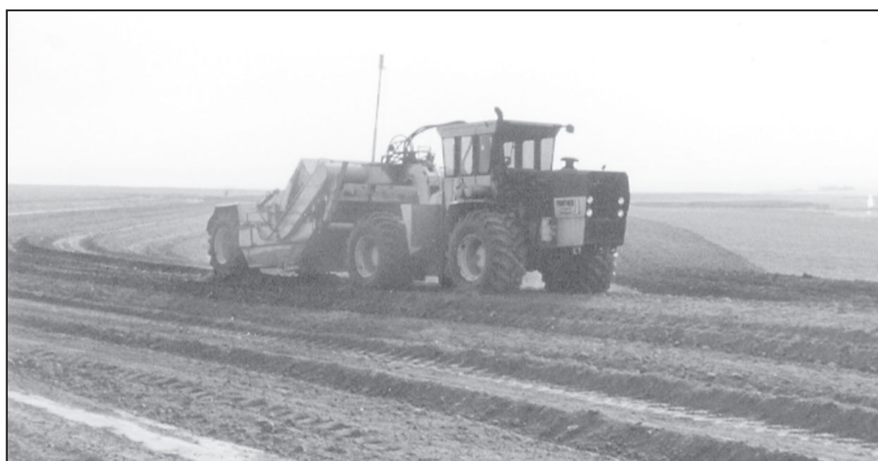
Soil Conservation Service technicians, Kenneth Knorr and Lenard Schlepp, top left, test new irrigation well with meter on Oct. 27, 1965. The well was located 2 miles east and 1 mile south of Bird City; clockwise, L.E. Hutchinson, Soil Conservation Service technician, examining bundles of brome grass seed in shocks. This is southern Nebraska brome grass. Kenneth Felzien at spring in his pasture. The spring was developed in 1917 and still provided adequate supply of good livestock water necessary for proper grazing management in 1963; L.L. Trumbull, supervisor of the Cheyenne County Soil Conservation district since 1949 looked over feedlot cattle at his farm. The photo was taken in 1965 on his farm 10 miles south and 5 miles west of St. Francis. Leroy Harris terracing scraper finishing a terrace. The photo was taken in 1965 on his farm 10 miles south and 5 miles west of St. Francis. The photo was taken in 1970. Glen J. Frewen, left, and Henry Hilt, one of the operators of this G.P.C.P. Unit - Tandem disc first operation of stubble mulch operation will be followed with 30-inch sweeps. Hilt Brothers used wide-spaced hoe drills. Residue measured approximately 5,000 pounds per acre, making one or two disc operations practiced. The photo was taken in 1959 13 miles east of St. Francis.