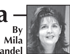
By Mila Bandel County Health Nurse