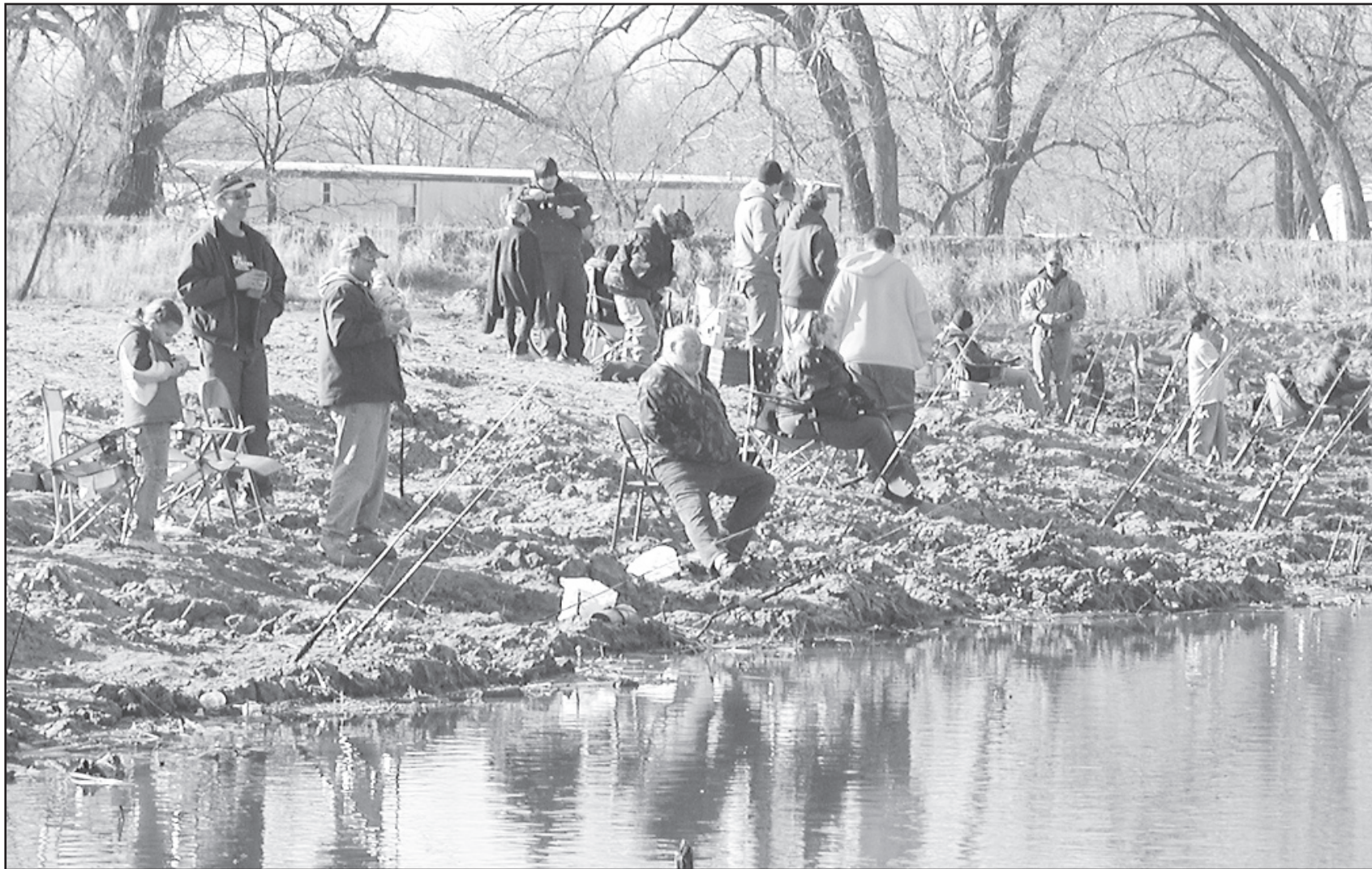
THERE WERE 46 TEAMS and at least 92 people at the fishing contest held Sunday at Keller Pond. The weather was beautiful and check out the reflection in the water. Early in the day, there was no wind and the pond looked like a sheet of glass.