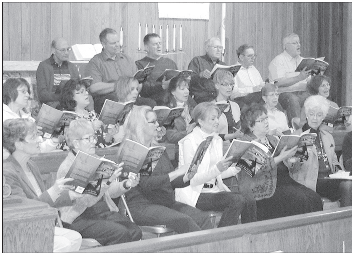
THE COMMUNITY CHOIR practices for the presentation of The Journey to the Cross that will be held Palm Sunday at Peace Lutheran Church.