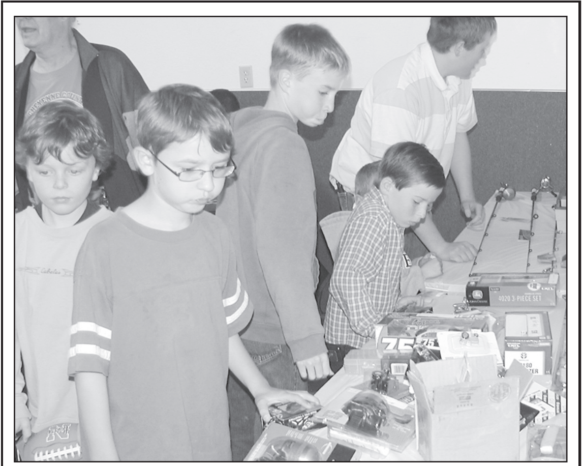
WHAT TO CHOOSE? Youngsters had a tough decision to make from all the things available at the kids table of prizes during the Cheyenne County Wildlife Inc.'s banquet