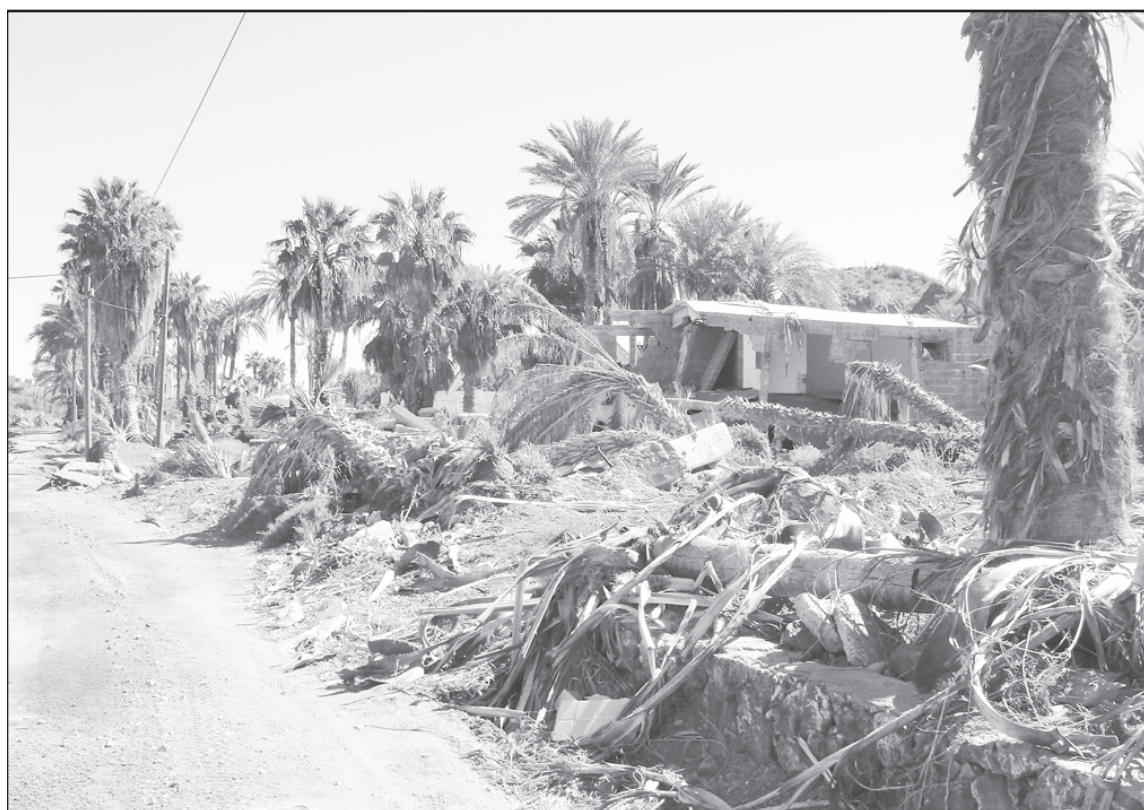
DEVASTATION FROM HURRICANE — A pile of rubble is all that is left on the south side of the Mulege River. All the homes were abandoned by their owners.