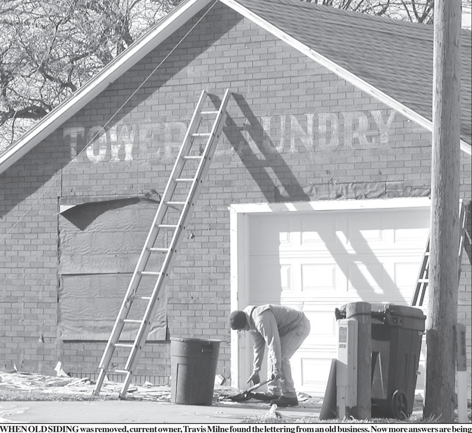
found about the Tower Laundry that used to operate on College Street.

Anyone who is eligible to be-Auxiliary of the Veterans of Foreign Wars is encouraged to join members at the next meeting to Participant Resources: About help as they meet and strive to Partners; Fieldkit Companion help Veterans and servicemen and Video (RealAudio); Eagle Scout women who are serving to protect Leadership Project; Hosting Com- this country and preserve free-