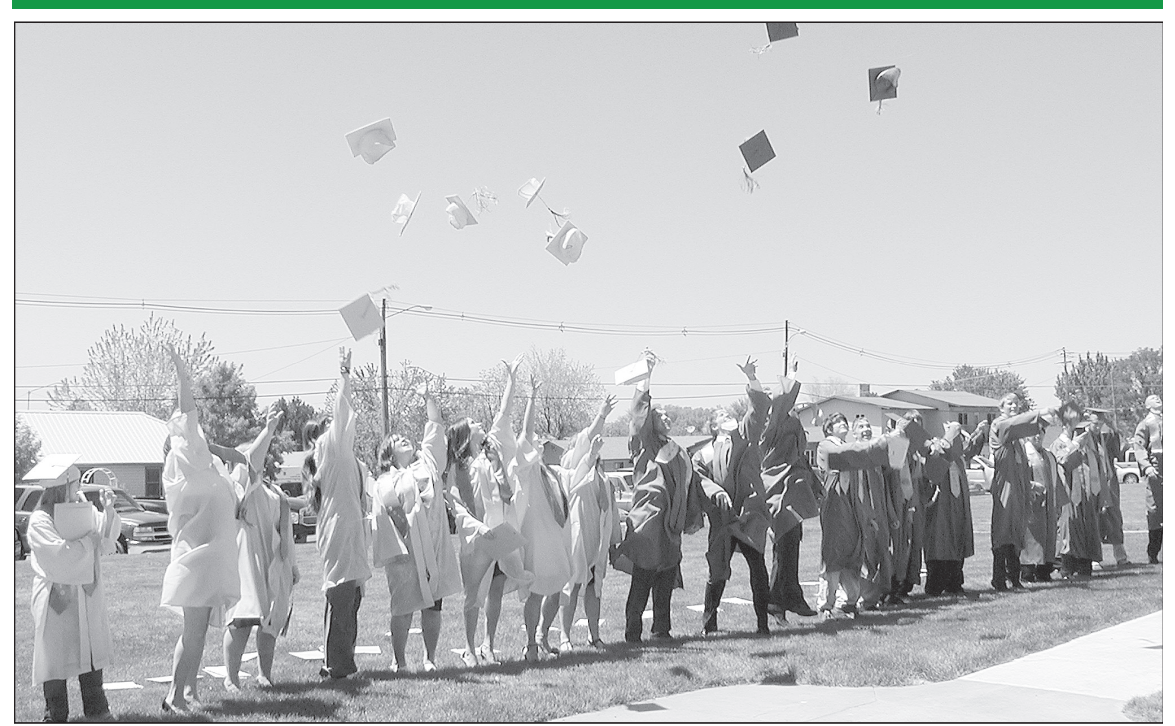
They're outta' here!! The class of 2010 tossed their caps following the graduation ceremony held Sunday in St. Francis.

$1 (Tax included: 73¢ delivered at home) 14 Pages Thursday, May 27, 2010 126th Year, Number 21