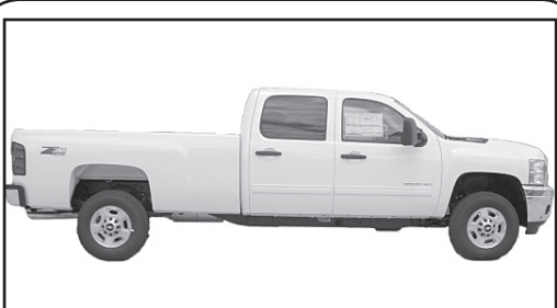
2011 Chevy 3/4 ton HD, White, cloth, 4x4, long box

caranddriver.com Calls the New 2011 Chevy and GMC HD "Bigger, Badder, and Better. The 6.0L has 360 hp and 380 lb. ft of torque." Vince's GM Center has 1 of each on the ground now. During the Summer Event we are offering 0% up to 72 months (w.a.c.) or up to $5000.00 Customer Cash on select 2010 models.