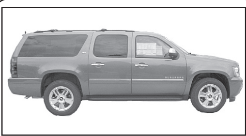
2010 Chevy Suburban, Stealth Gray, leather, 2 dvd players, sunroof