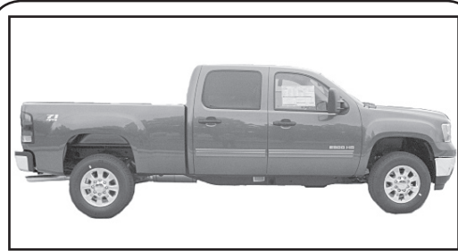
2011 GMC 3/4 ton HD, Stealth Gray, cloth, 4x4, short box