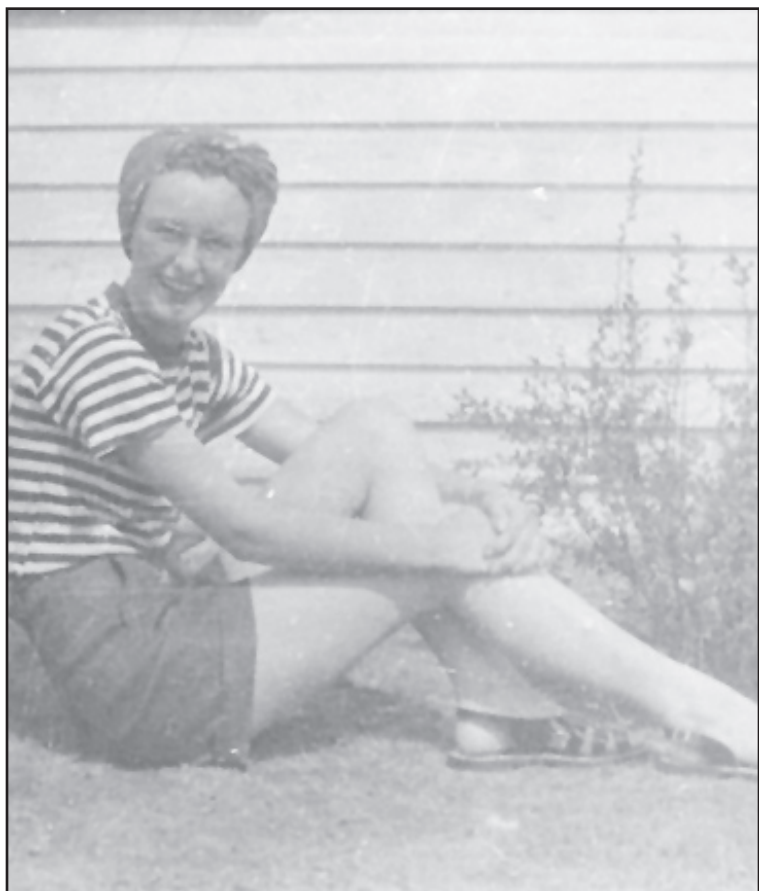
2010 Thresher Queen