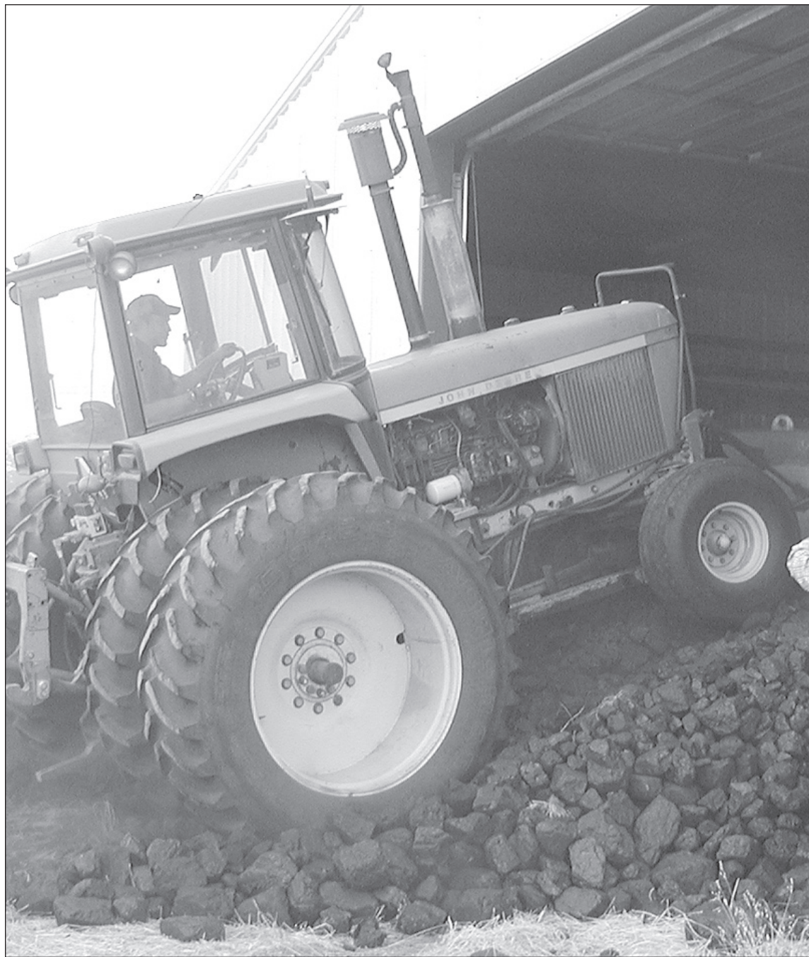
COAL IS DELIVERED to the Thresher grounds in Bird City to power the engines during the show. Brenden Haack dozes the coal further back into the building.