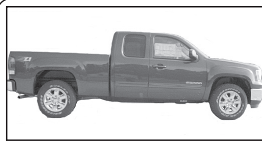
2010 GMC 1/2 ton ext-cab, Storm Gray, leather, 4x4

thought to ponder.....why are women and men's shoe sizes different?