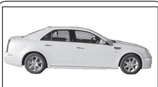
2008 Cadillac STS, White Diamond, Heated and Cooled Seats

We also have a GREAT selection of pre-owned vehicle's