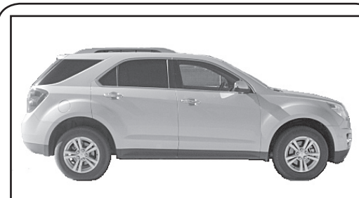
2010 Chevy Equinox, Gold, Leather, Awd