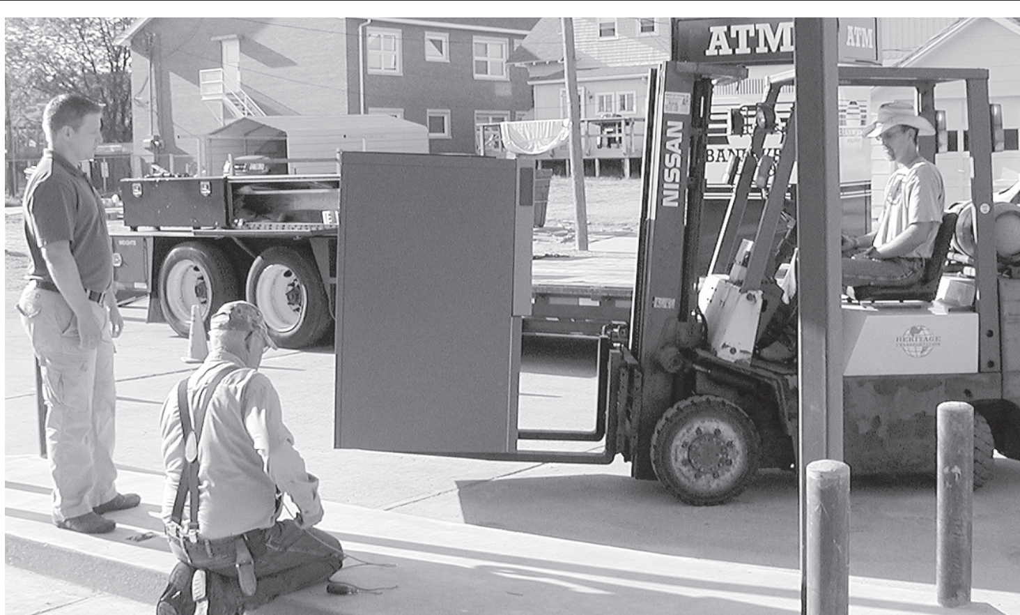
BANKWEST INSTALLED a new ATM machine on the south side of bank. Workers were busy getting the equipment set on Wednesday morning. There is also new curb and gutter.