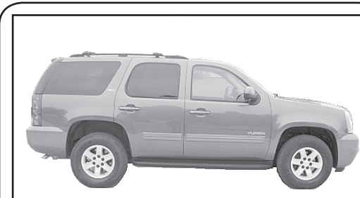
2010 GMC Yukon, Stealth Gray, Leather, Heated Seats

thought to ponder.... did you know it's impossible to sneeze with your eyes open?