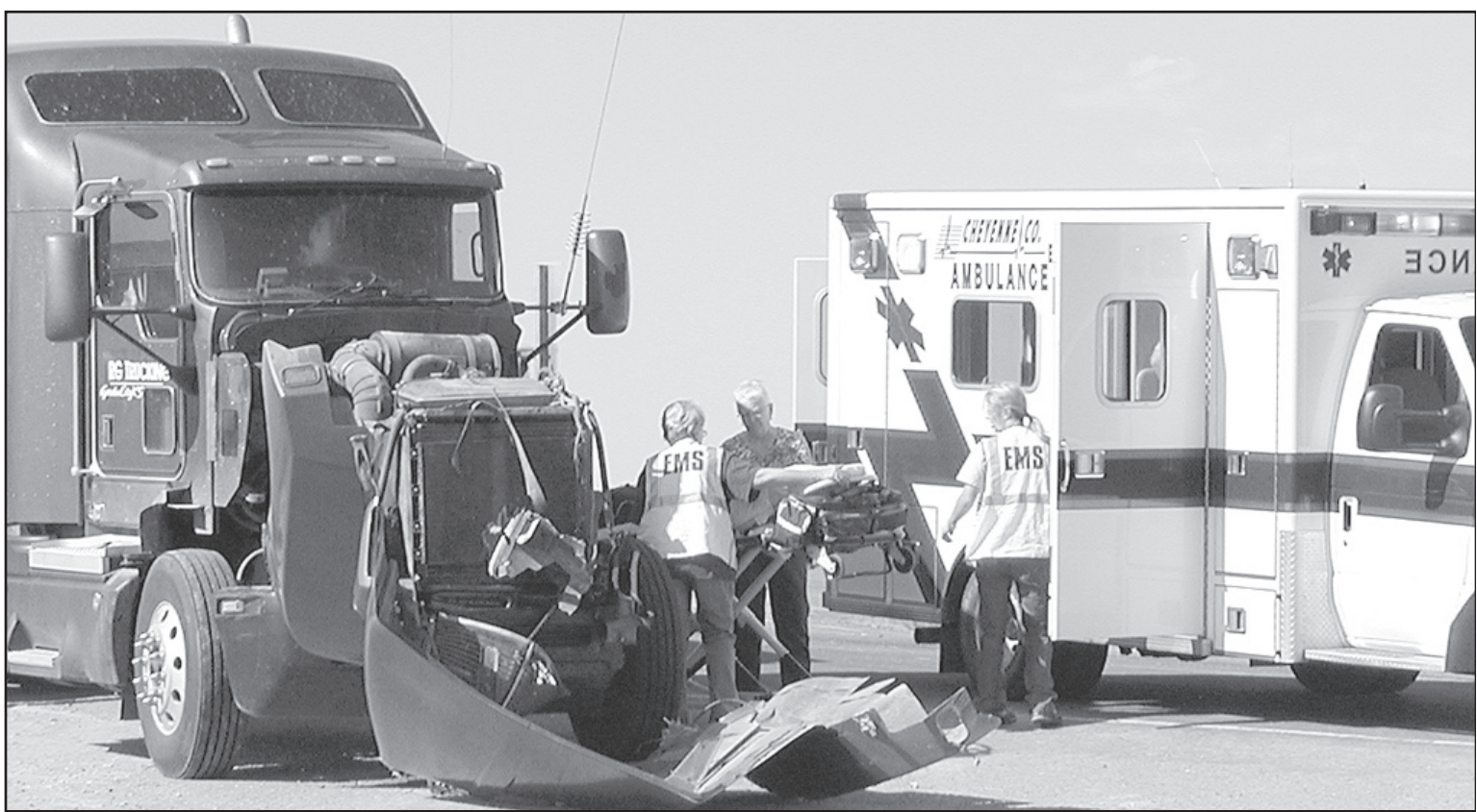
TWO SEMI TRUCKS collided at the Wheeler intersection turn on U.S. 36 last Friday.

"Secretary Vilsack and Attorney General Holder are coming to Colorado to meet with farmers, ranchers, processors and others who have a stake in the beef and hog market here in Colorado," said Sen. Mark Udall, D-Colo. "This workshop is an opportunity for the federal government to hear Coloradans' voices as well as for farmers, ranchers and processors to discuss this important matter, and I want to encourage Coloradans to attend."