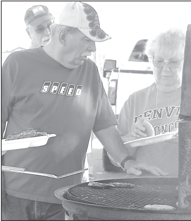
A HAMBURGER FRY was held when the run was over.

Some of the winners donated some or all of their winnings back to the flagpole fund. There was also a donation of $200 made be-