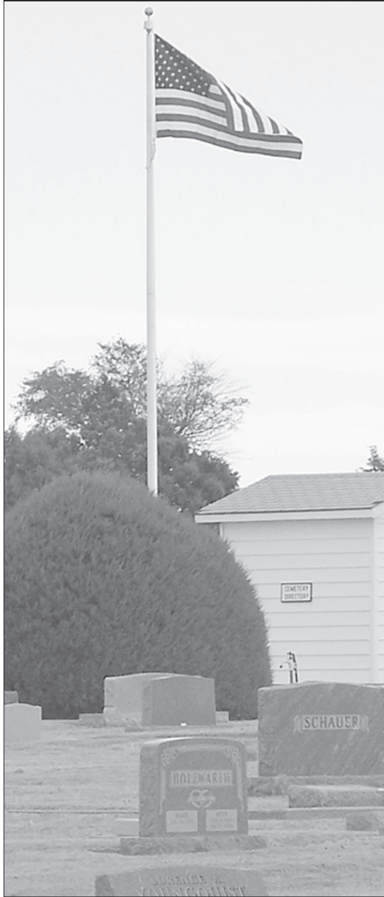
EASY TO SEE , the new 25 foot pole is a good addition to the cemetery located on the east side of town.

To donate to the flag project, contact Scott Schultz or Kent Kechter.