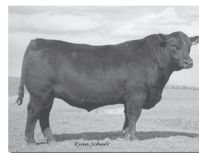
Schurrtop Reality - Sons and grandsons sell. Proven calving ease, muscle and marbling.

SCHURRTOP ANGUS & CHAROLAIS Sure Performance Cattle 40842 Farnam Rd • Farnam, NE 69029 www.schurrtop.com