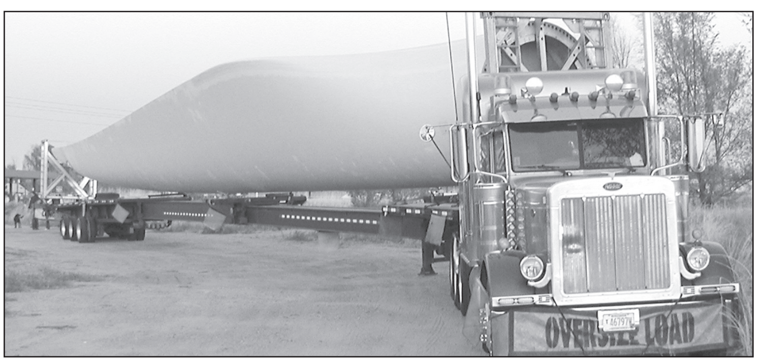
A PORTION OF A WIND TOWER stayed overnight in St. Francis over the weekend. Because of it's size, the truck was required to wait until it could legally travel.