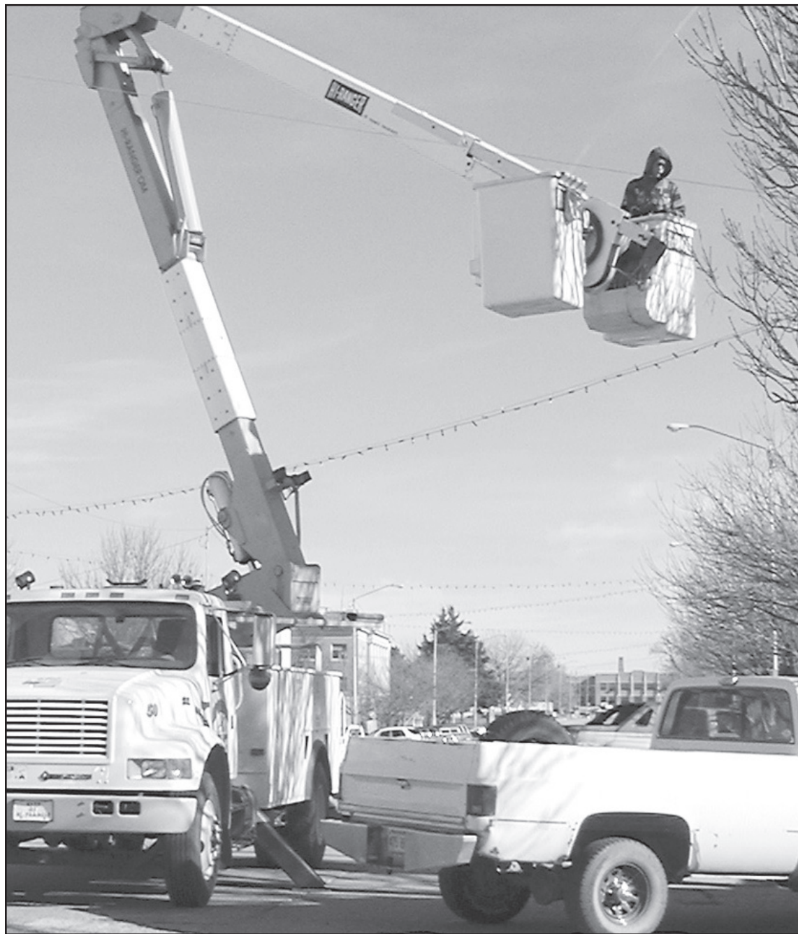
ST. FRANCIS CITY CREW strung the Christmas lights across Main Street before bad weather came and the Christmas season opened on Friday.

The parade is led by the city police. See PARADE on Page 8A