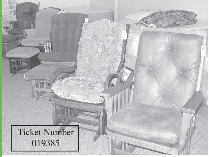
Instock & ready for "him" or "her"