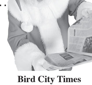
In Area $33, In State $36 Out of State $40

St. Francis Herald In Area $38, In State $42 Out of State $48