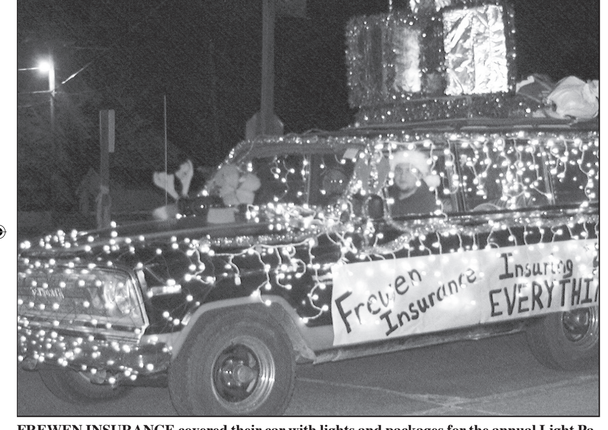
FREWEN INSURANCE covered their car with lights and packages for the annual Light Parade held on Friday night.