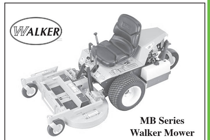
MB Series Walker Mower