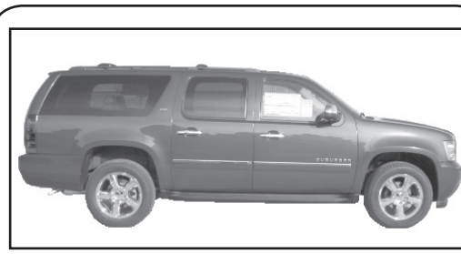
2011 Chevy Suburban LTZ, Red Jewel, Leather, Dvd Player

thought to ponder.....how do you know when yogurt goes bad?