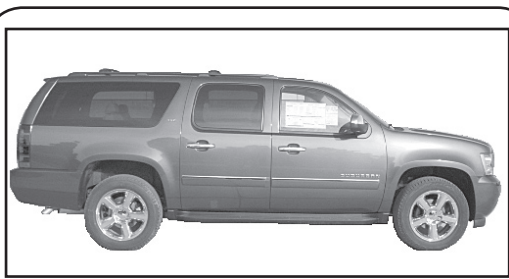
2011 Chevy Suburban LTZ, Gray, Leather, Dvd Player