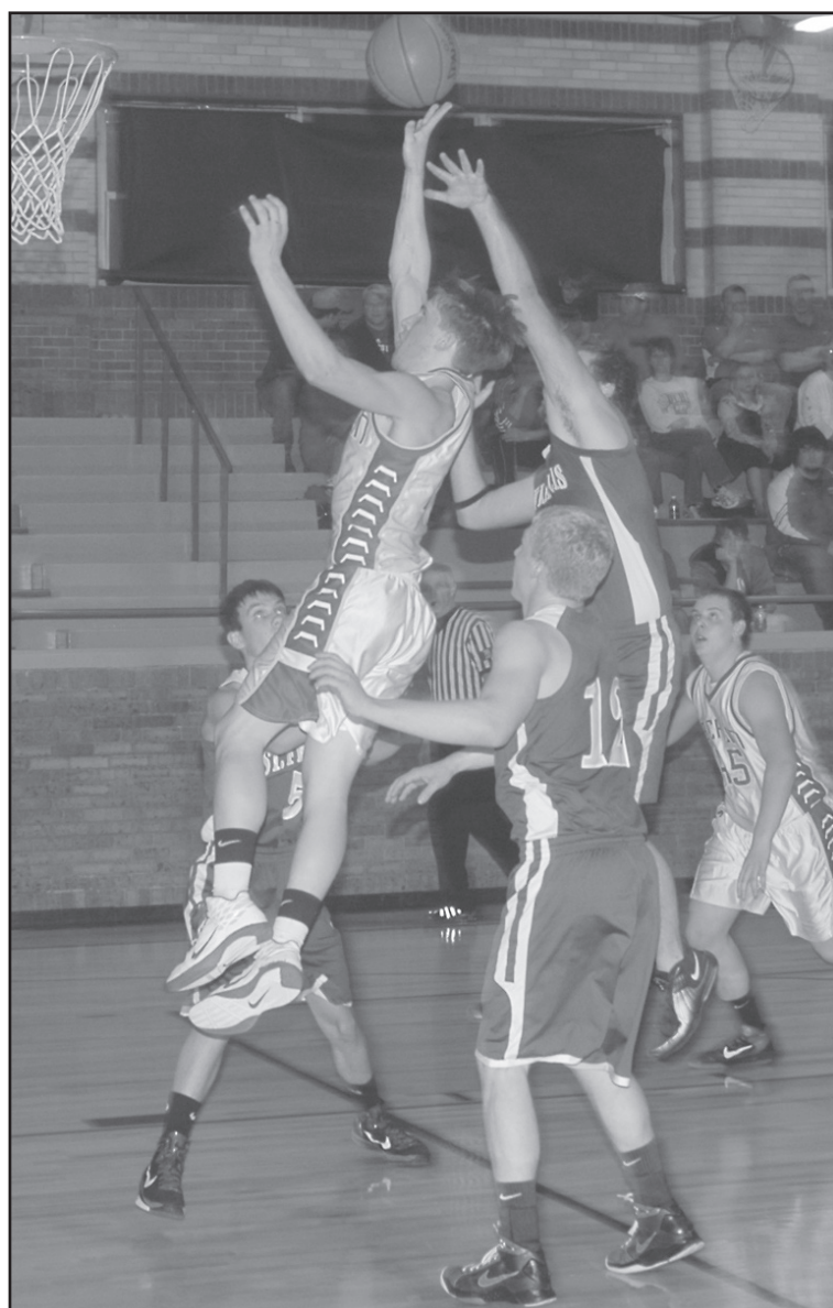
ST. FRANCIS INDIANS are trying to block a shot from the opposite team, Decatur Community.