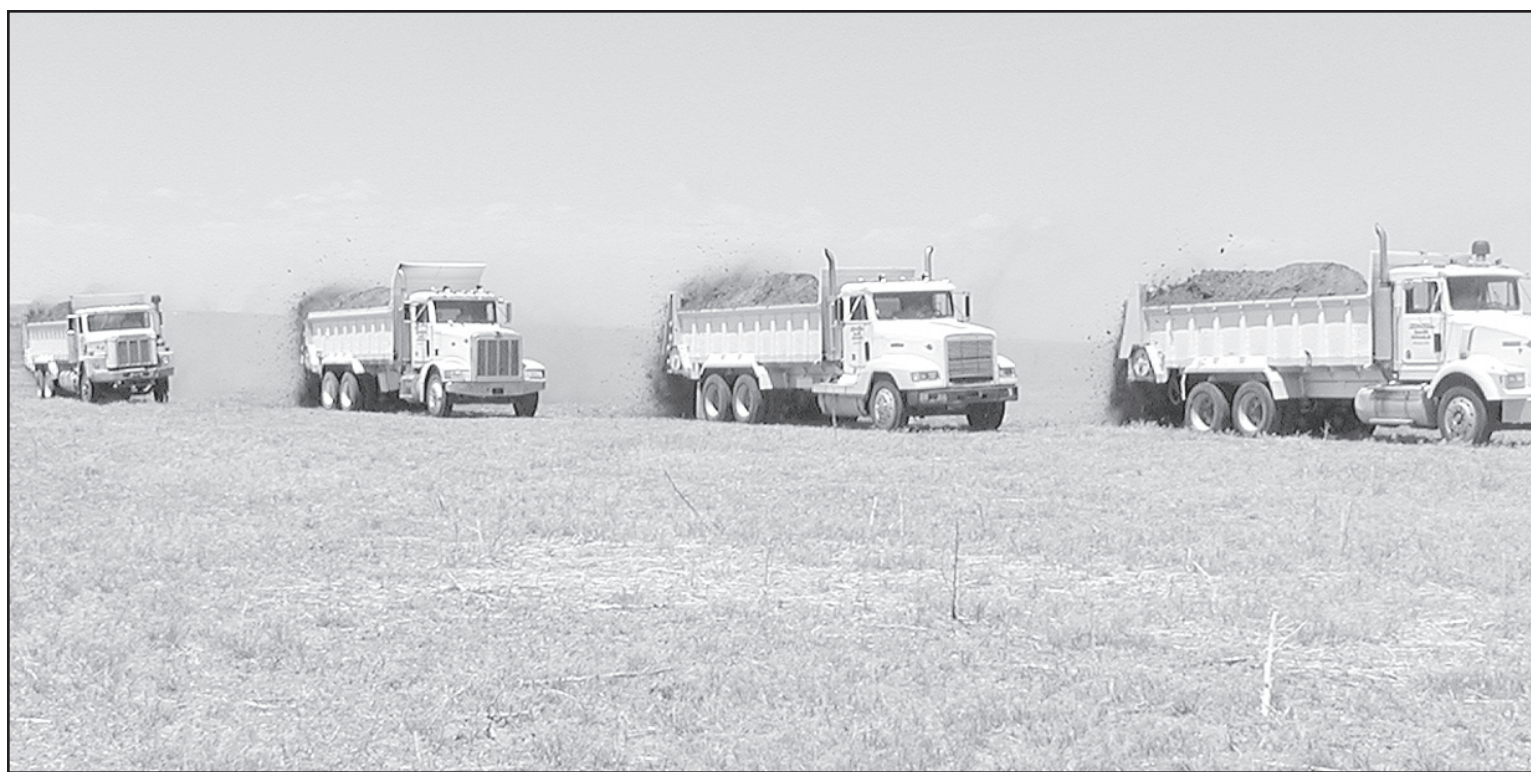
HILT & HILT LLC trucks spread organic fertilizer from the feedlot on a farmers field south of town.