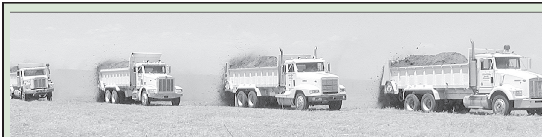
HILT AND HILT LLC is the name of a manure-spreading operation. They have four spreader trucks which is added efficiency. They also have three wheel loaders and a dozer loader allowing them to do dirt work as well as removing trees and foundations.