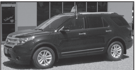
2011 Ford Explorer XLT, FWD, Kona Blue, cloth interior, for $35,370, stock #T3476