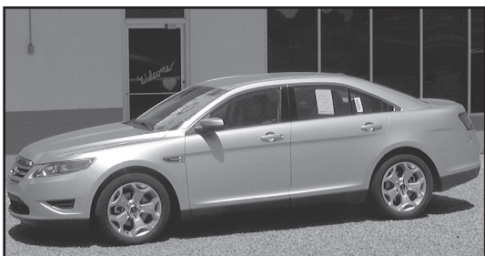
2011 Ford Taurus SEL, Ingot Silver, nicely equipped for $33,145, three to chose from, stock #85233