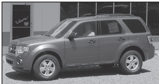
2012 Ford Escape XLT, AWD, Steel Blue Metallic, Sunroof and Tune pkg., $29,730, stock #T4630