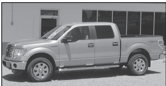
2011 Ford F-150 ECOBOOST XLT, twin turbo, 365 hp V-6, for under $40,000, stock # T5584