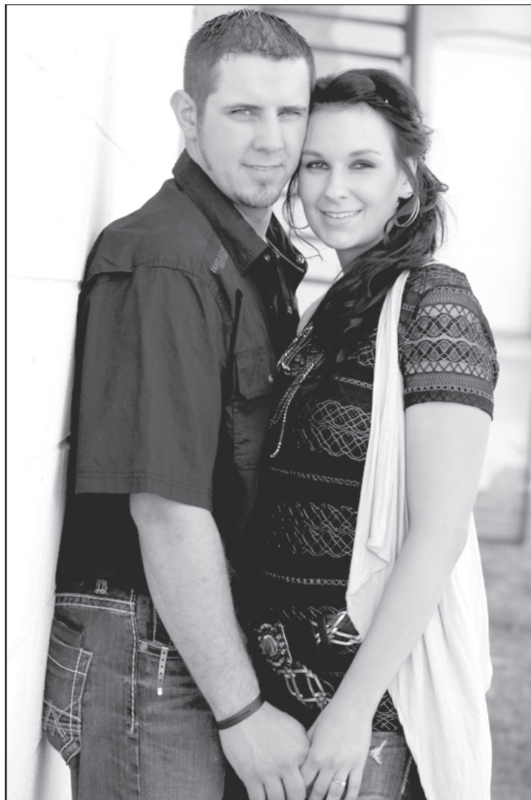
Zimmerman — Zwegardt