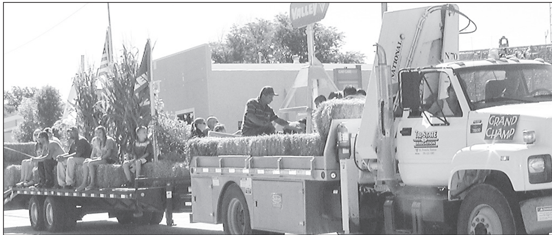
GRAND PRIZE float in the fair parade on Saturday was Tri-State Irrigation.