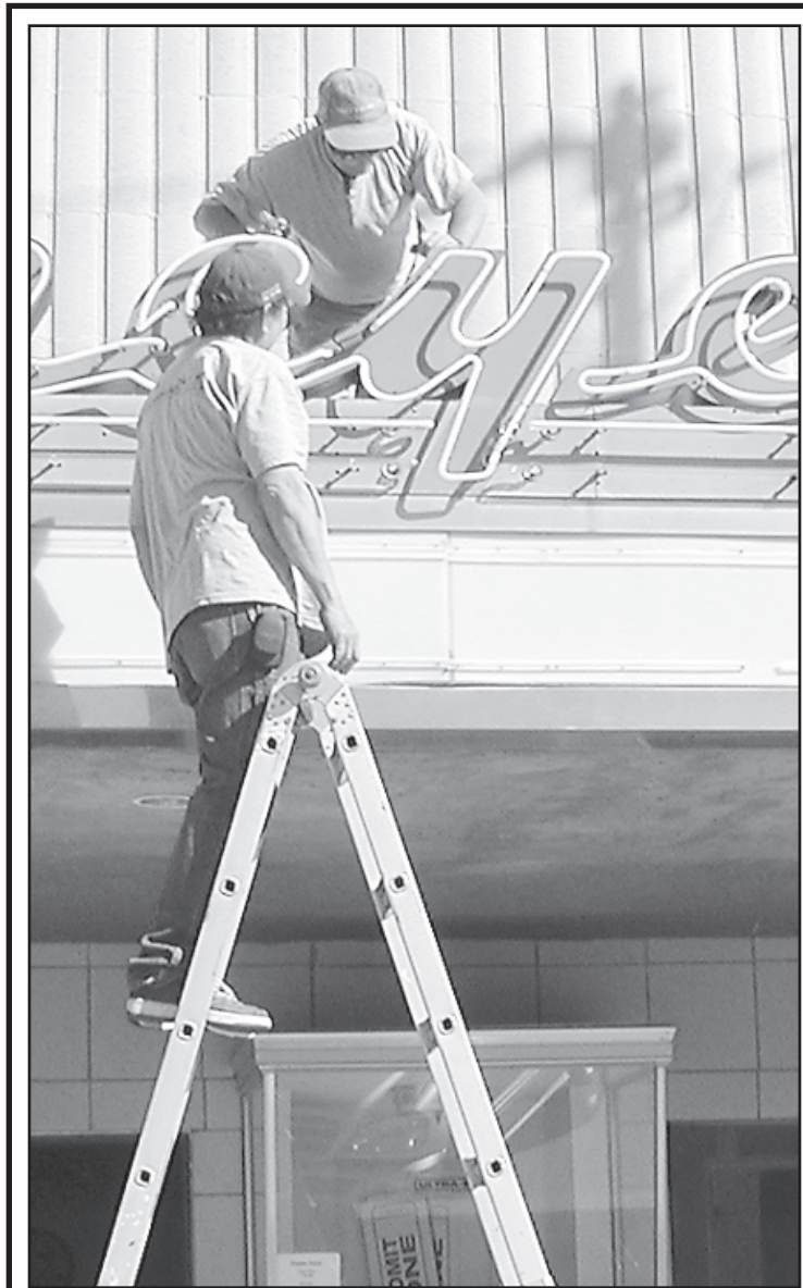
Y- WHAT'S WRONG?- Employees from Commercial Sign Company out of Colby work on the letter 'y' of the Cheyenne Theater sign.

The next meeting of the city council will be held at 7:30 p.m. on Monday at city hall on Main Street.