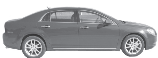
2011 Chevy Malibu, Red, Leather, Sunroof