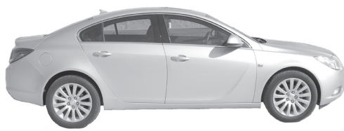
2011 Buick Regal, Silver, Leather, Sunroof

Are you wanting to upgrade your vehicle, but you don't want to go new? Great, here at Vince's GM Center we also have a good selection of pre-owned vehicles