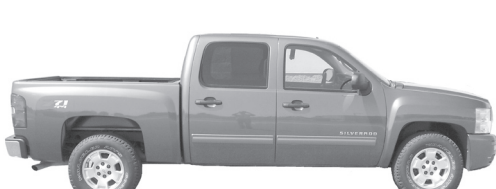
2011 Chevy 1/2 Crew Cab, Cloth, 4X4