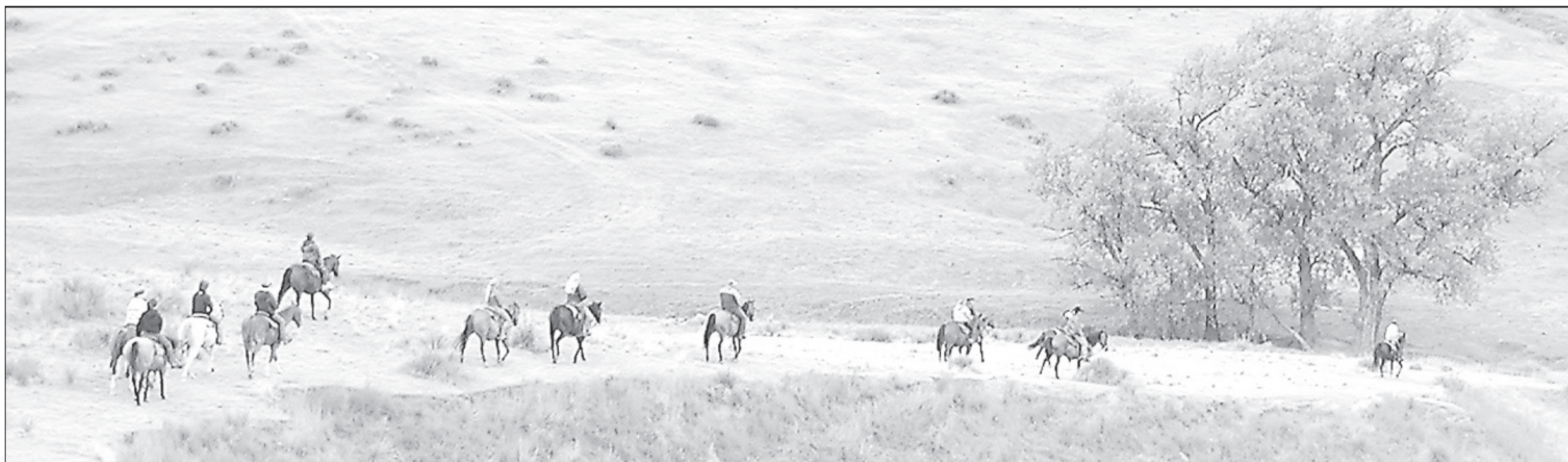
ANNUAL TRAIL RIDE— Several riders head out for a two hour ride northwest of St. Francis.