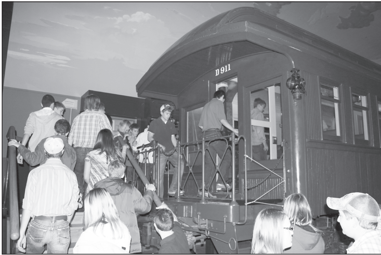
CLASSMATES EXPLORE a decommissioned train car at the Kansas History Museum. The entire eighth grade class was able to go on a trip to Topeka, visiting museums and the state capitol, thanks to a donation from the Hansen Foundation.