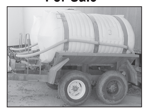
3— 1000 gal. liquid trailers, Honda motors, 2" plumbing.