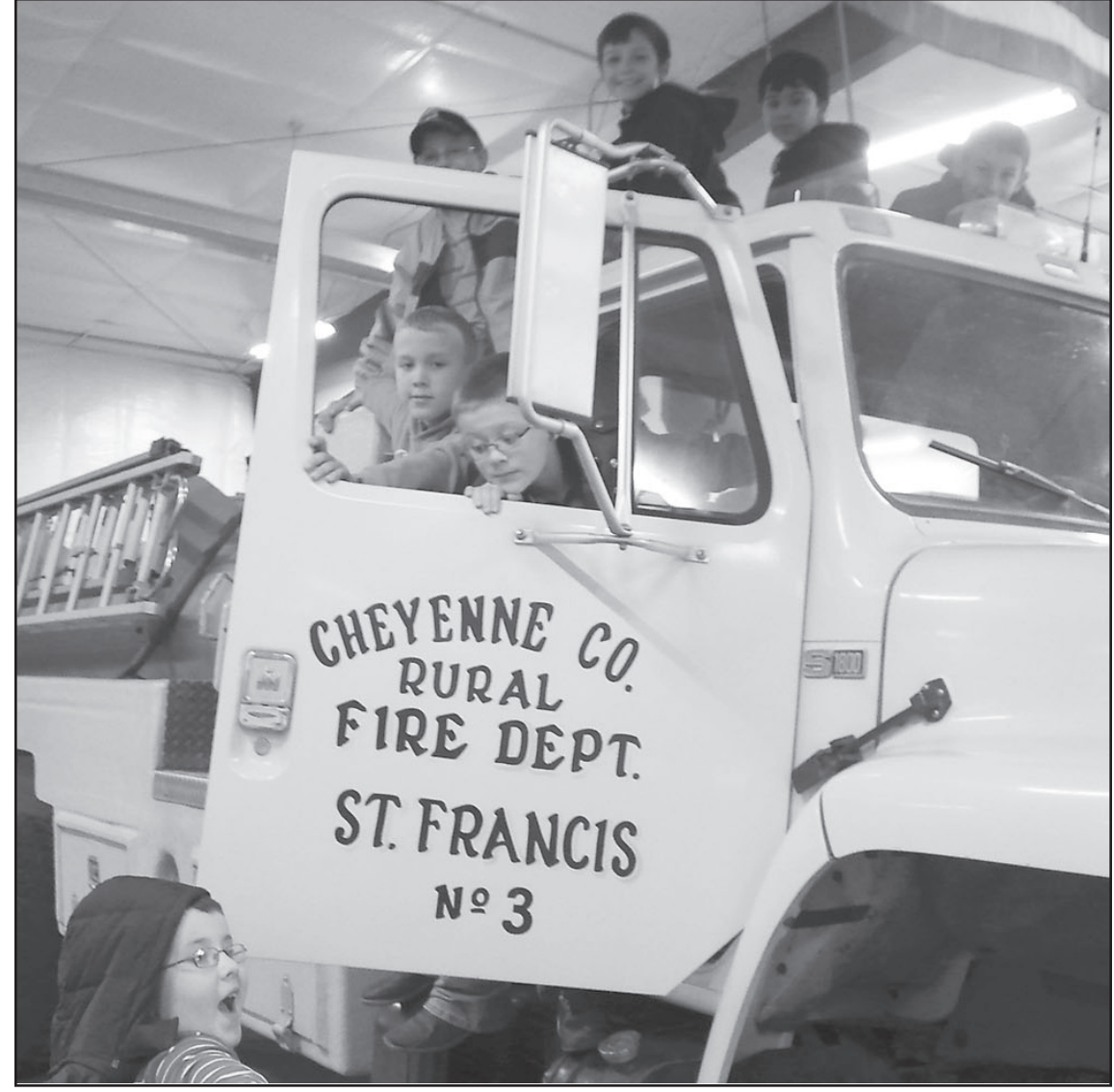
CUB SCOUTS pile into a fire engine during their tour of the fire department.

interlibrary loan and showed the and Lyle Whitmore for donating the bathroom tiles. We hope to finish this project soon; also to the city employees who put the clear coat on the outside of the building and all the rest of the people who have been involved with the way it looks. Many compliments have been received and the Scouts are very proud of it.