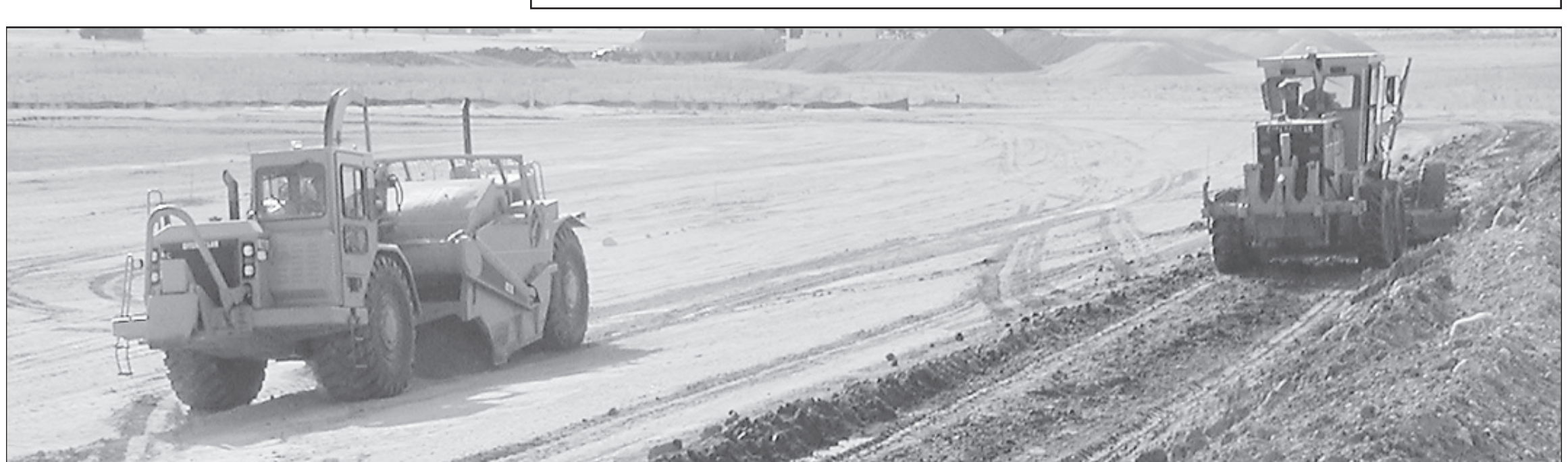
GROUNDWORK HAS RESUMES at the Cheyenne County Airport. The runway will be longer and wider. Construction is expected by be completed by the end of July.