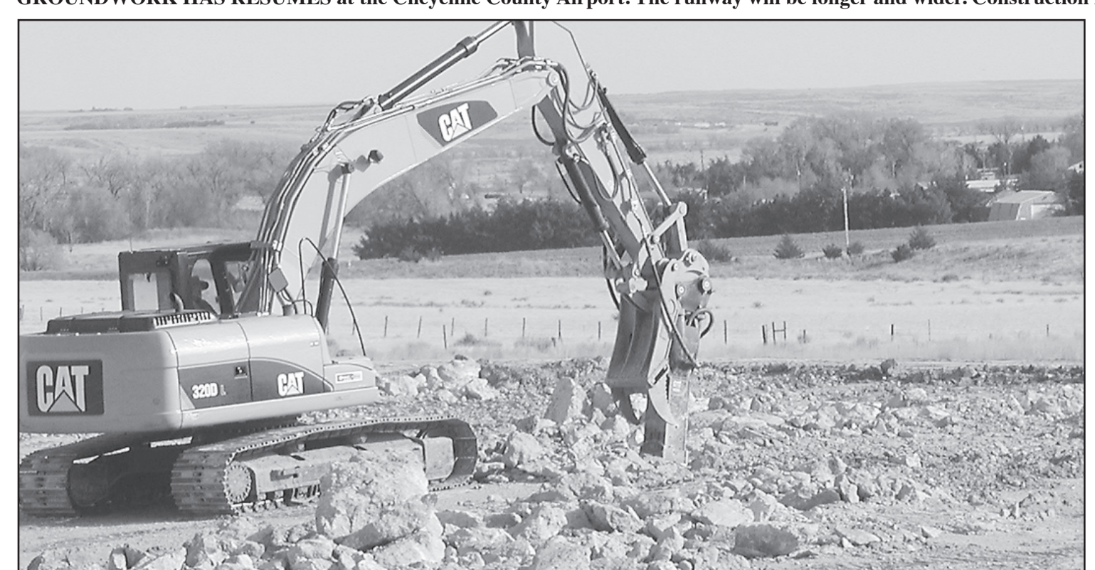
SOLID ROCK was found under a portion of the runway extension. This huge jack hammer was clearing away the rocks and trucks were hauling it off so the dirt work could be done.