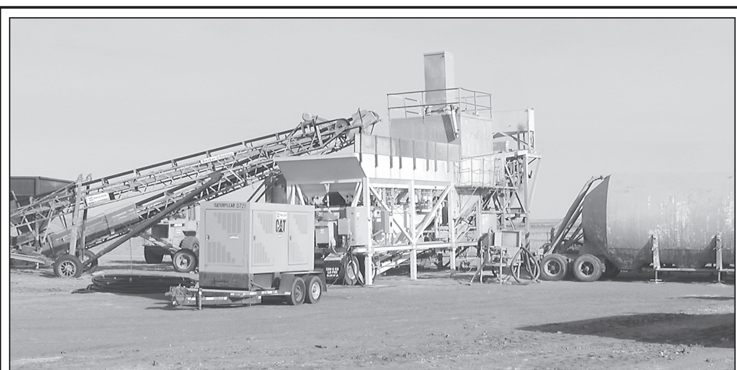
CONSTRUCTION CONTINUES at the airport in St. Francis.