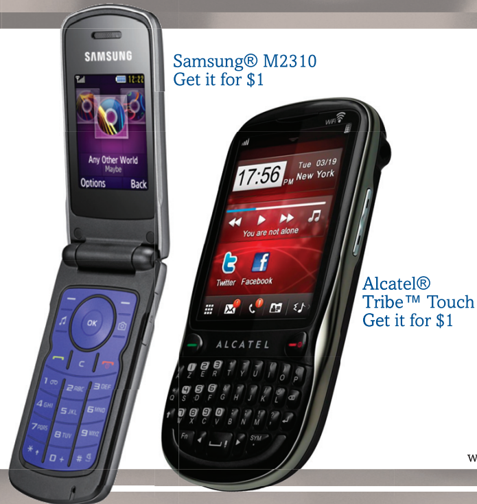
Samsung® M2310 Get it for $1