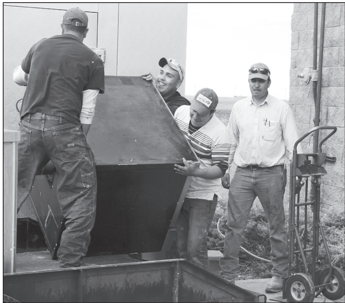
THE WALLS on 'The Grainery' are going up and the new restaurant, located on the west side of Idalia, will soon have a roof. Community volunteers are doing much of the work. Right, volunteers unload a stove from the Idalia School to be used in the restaurant. The windows and other appliances will be salvaged for the restaurant before the school is torn down, making way for the new school.