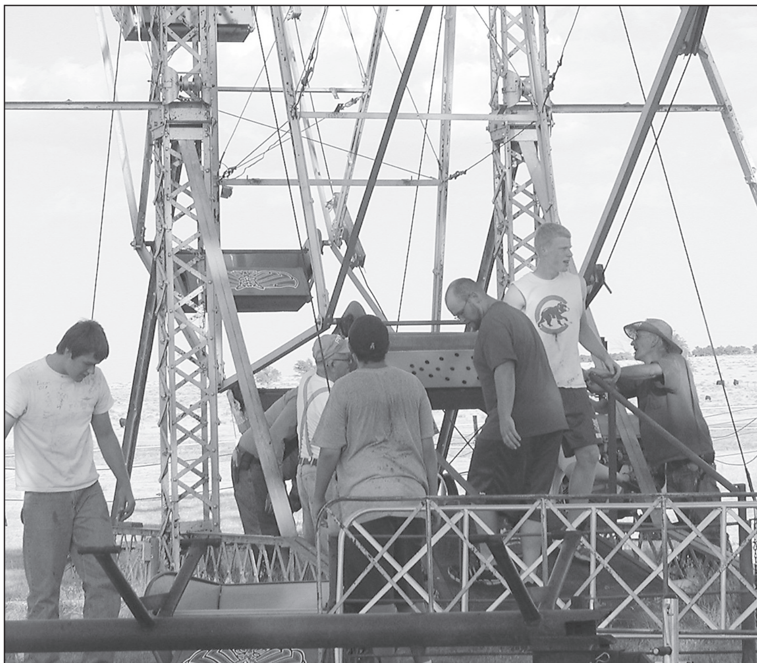
MEMBERS of the St. Francis football team helps the amusement authority attach the seats to the ferris wheel.